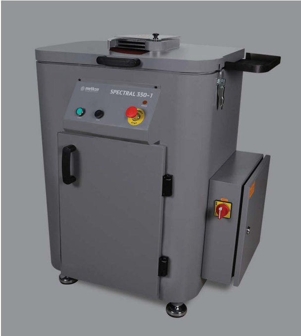
SPECTRAL 350-1 Single Disc Grinder

SPECTRAL 350 is used to achieve excellent precision flat surfaces of iron and steel samples for spectroscopic analysis. The robust and vibration-free construction has been designed for continuous operation at high sample throughput.