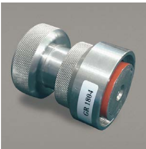
Magnetic Type Sample Holder

Magnetic and mechanical specimen holders for samples up to 50 mm. dia. available ensure maximum operator safety.