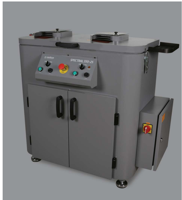
SPECTRAL 350-2S Double Disc Surface Grinder