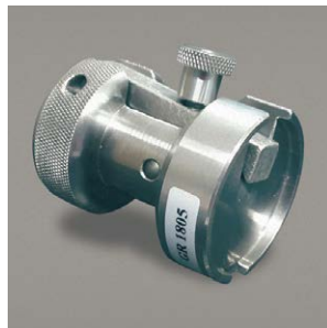
Mechanical Type Sample Holder